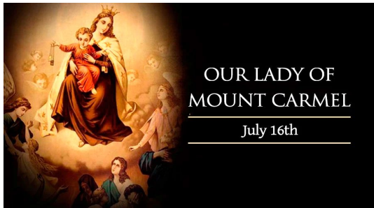
OUR LADY OF MOUNT CARMEL July 16th